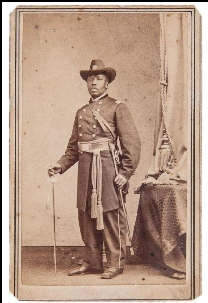
Studio portrait of Maj. Martin Delany in military uniform, circa 1864. Sold for $59,375