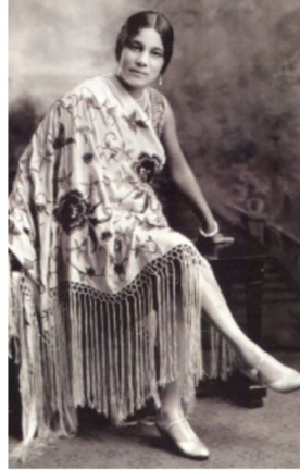
Beatrice Hulon Morrow Cannady

APRIL 15, 2008 / CONTRIBUTED BY: BLACKPAST